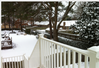
Virginia Beach - January 29, 2014